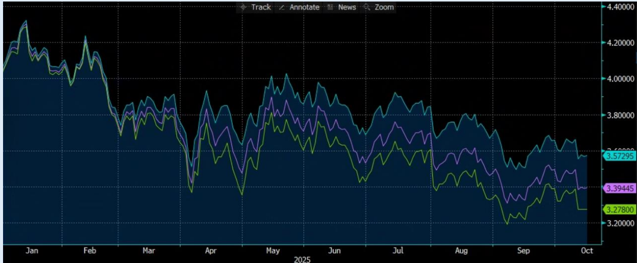
5Y (green), 7Y (purple) & 10Y (light blue) SOFR SWAP RATES, YTD 2025

Disclaimer: The information provided in this communication is intended for discussion purposes only. Nothing presented in this communication should be taken as a recommendation or forecast. All market data shown is indicative only and subject to change depending on current market conditions.