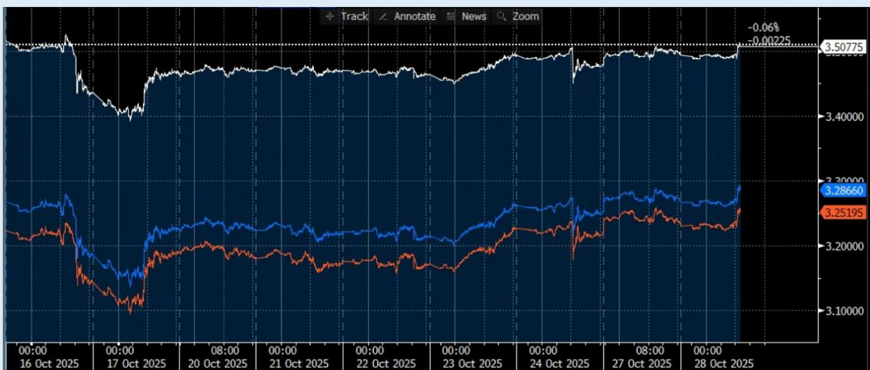
CHART 2: 1Y, 2Y & 3Y SOFR SWAP RATES – PRIOR 10 TRADING SESSIONS; MARKET AWAITS FED RATE DECISION

1Y (white), 2Y (blue) & 3Y (orange) SOFR SWAP RATES, PRIOR 10 TRADING SESSIONS