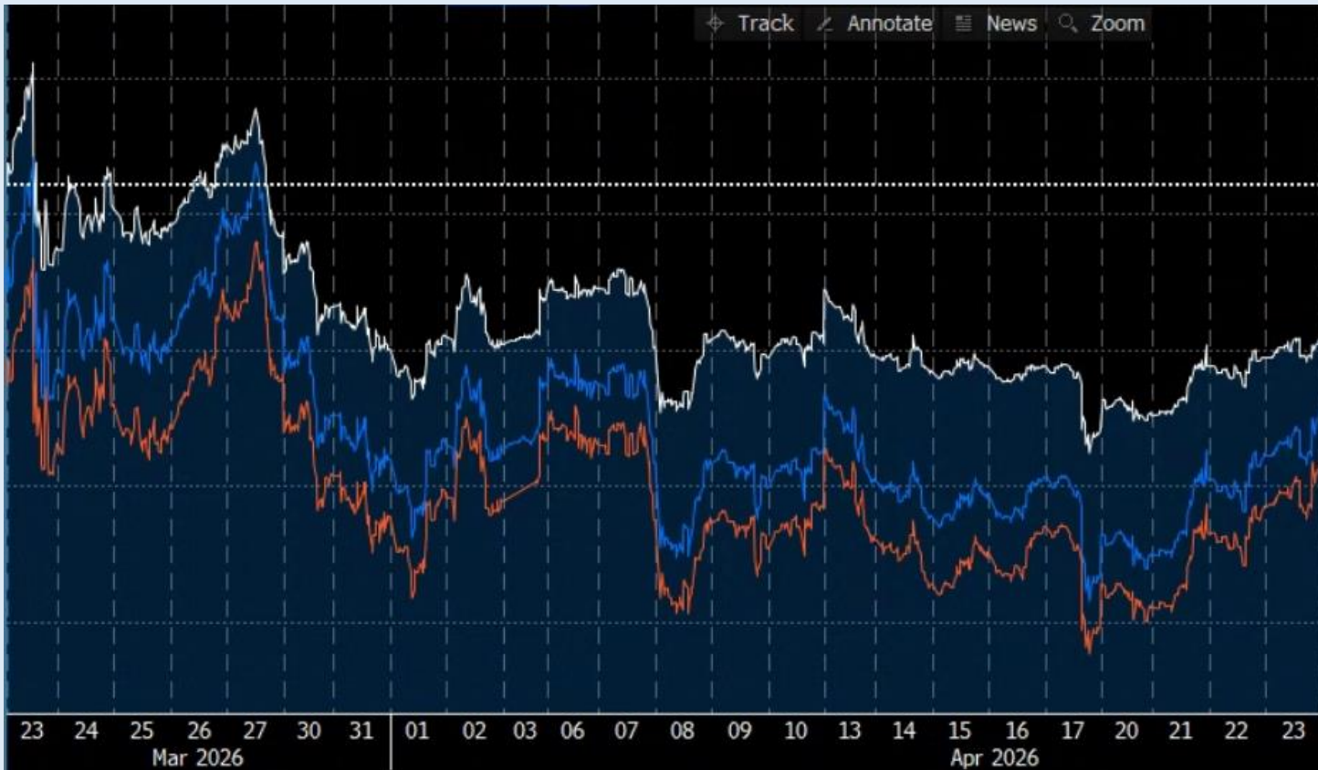
1Y (white), 2Y (blue) & 3Y (orange) SOFR SWAP RATES; PRIOR 30 TRADING SESSIONS