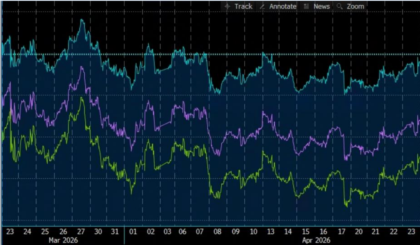
5Y (green), 7Y (purple) & 10Y (light blue) SOFR SWAP RATES; PRIOR 30 TRADING SESSIONS